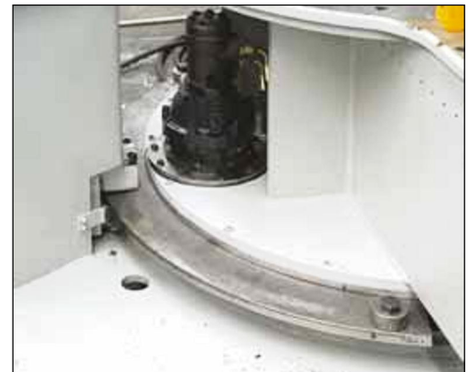
Powered device for the rotation of the saw