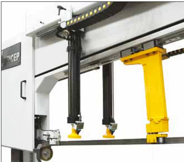
Hydraulic vertical hold-downs that manually slide on prismatic guides (optional)